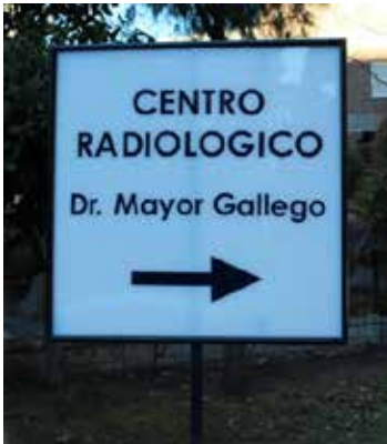
The Radiological Clinic has offices located in Madrid, Móstoles (Madrid) and Lanzarote (Canary Islands).