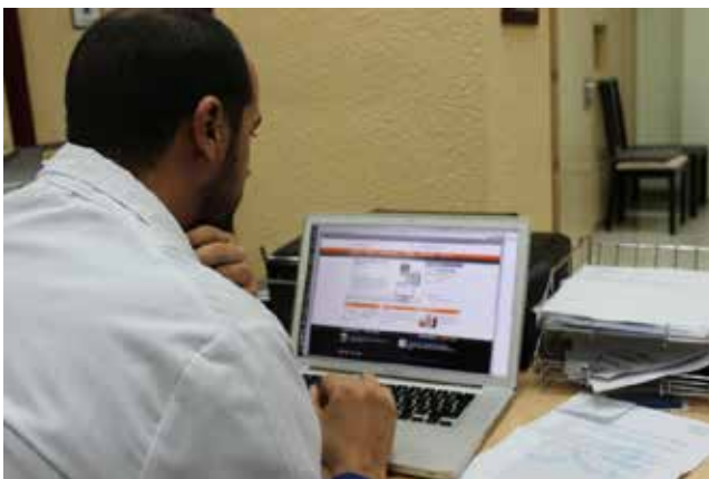
View film consumption and printer activity on the MPS Web Portal

The other big advantage is the availability of a huge amount of information on Carestream's MPS Web Portal. On the portal, I can access my consumption data at any time. Although I have only one printer in my office, I can see the data relating to my printers in the Móstoles and Canary Islands centers, either simultaneously or separately. In this way, I can always know their activity level: their daily, weekly or monthly consumption, their costs, their performance, and their status. Another thing I really like is that every time the system places an order, I receive a notification e-mail.